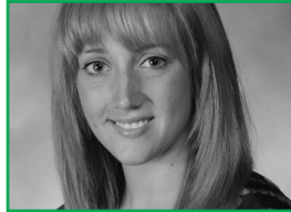
Jenna Lee Margaret McGinnis Feathers Scholarship