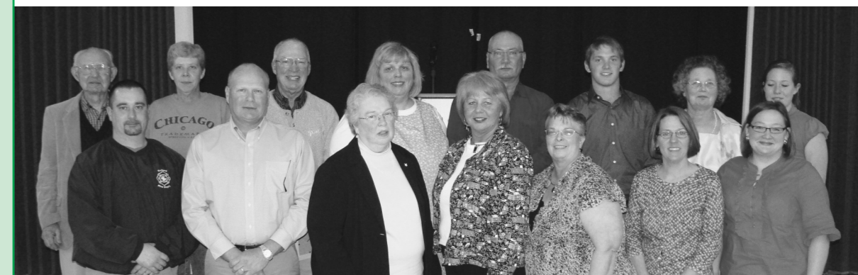
2009 Helping Hands Nominees

Started by the Foundation, Helping Hands is a program set up to recognize and thank area volunteers for all they do. Donating time and talent, our area volunteers help improve the community as a whole and serve as amazing role models for others.