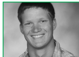
Nicholas Clark Dollars for Scholars Russell Krebs Memorial Scholarship